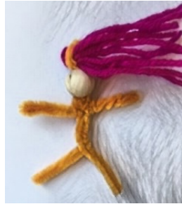
Push hair through loop