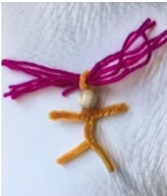
Twist and squash down pipe cleaner loop to secure hair