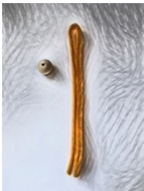
Fold pipe cleaner in half