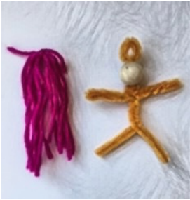
Fold hair over