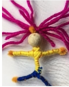
Knot at the back