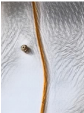
Pipe cleaner and bead