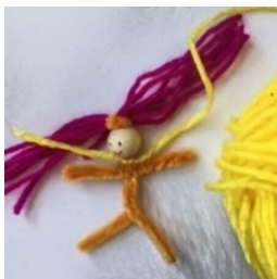
Start making clothes – knot wool