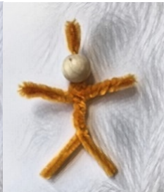
Thread pipe cleaner through bead